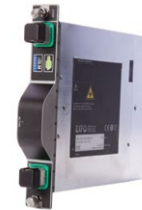
This picture is shown as a guideline only. Actual module may differ depending on the configuration selected.