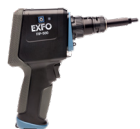
Fiber inspection scope FIP-500